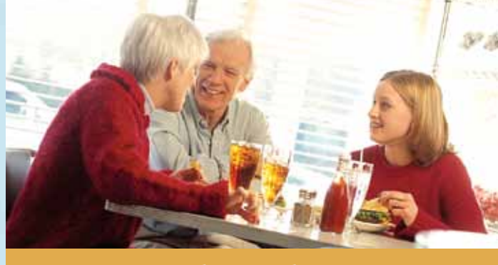
"We want to leave a legacy to our grandchildren and be remembered long after we're gone."

Permanent life insurance that provides a guaranteed death benefit plus the opportunity to conservatively accumulate future wealth in a tax-advantaged way.